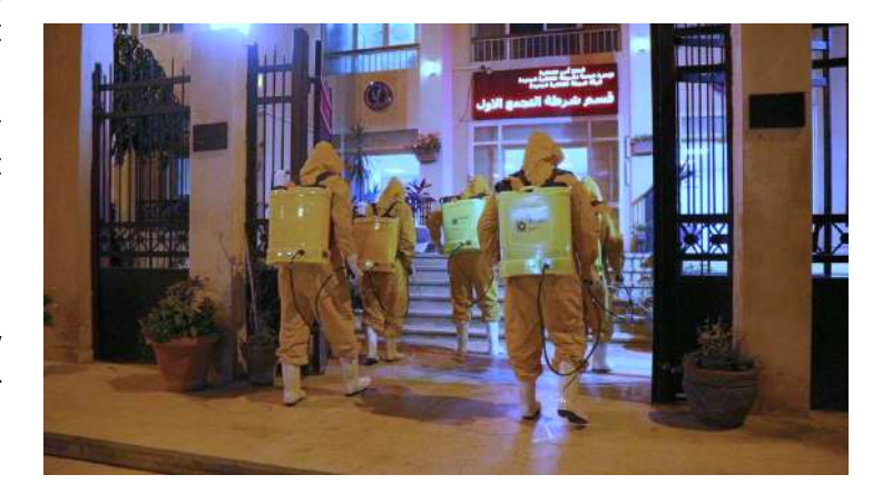
Sterilization and disinfection efforts in all police buildings and facilities in Egypt

UNODC works to ensure that children are better served and protected by justice systems and that international standards and norms are applied to the rights children safeguard of in administration of justice. UNODC delivered an online training to officials from correctional institutions and juvenile centers in Egypt aimed at strengthening their response to COVID-19 and protecting the children and youth in these centers from the spread of the virus following international health and human rights standards. Juvenile centers and correctional institutions could face several unique challenges in preventing COVID-19, such challenges include the concern of newcomers carrying the virus to the institution or facility, the difficulty of maintaining safe physical distancing when many individuals are living and working within the same closed settings, the dependency of the children and youth on family visits for emotional and mental support which would be restricted due to limiting any external visits and the lack of group-based activities and interactions.