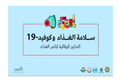
Preventive Measures in Food Production Campaigns