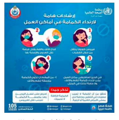
Wearing Facial Masks Campaigns