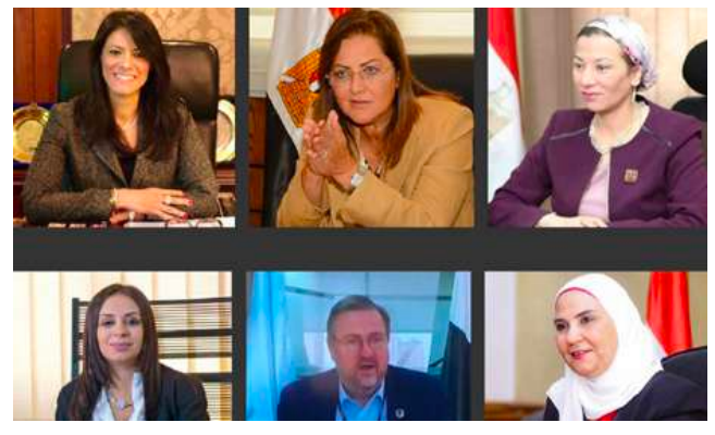
High Level Online Coordination Meeting between (from left to right) Minister of International Cooperation, Minister of Planning, Minister of Environment, President of the National Council of Women, the Resident Coordinator of the United Nations in Egypt and the Minister of Social Solidarity (April 2020)