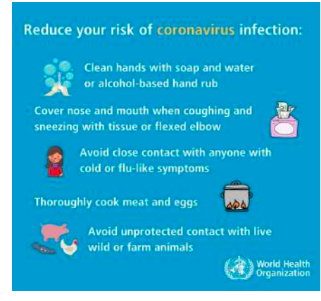
COVID-19 Information Campaigns

The videos include guidelines on adapting food safety management systems to the conditions of prevention and management of COVID- 19 and in particular enhanced hygienic practices, food safety measures and physical distancing. The videos leveraged the information produced by various food safety authorities and risk assessment agencies, including the guidance developed by FAO and WHO.