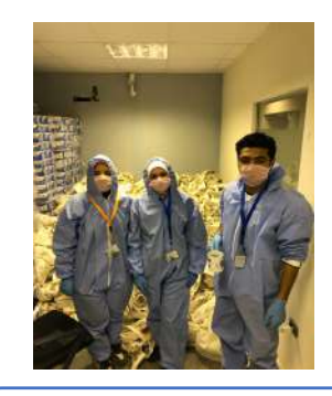
Y-PEER volunteers managed to pack 11,000 kits in 10 days.