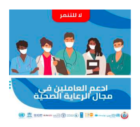
Anti-bullying for the healthcare workers Campaign