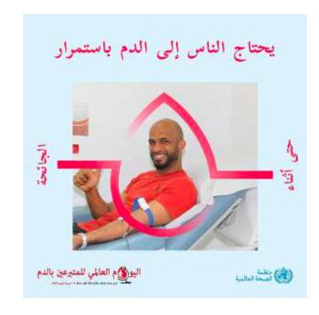
Blood Donation Campaigns