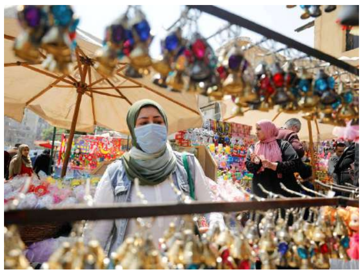
Egyptian Markets during the lockdown – April 2020