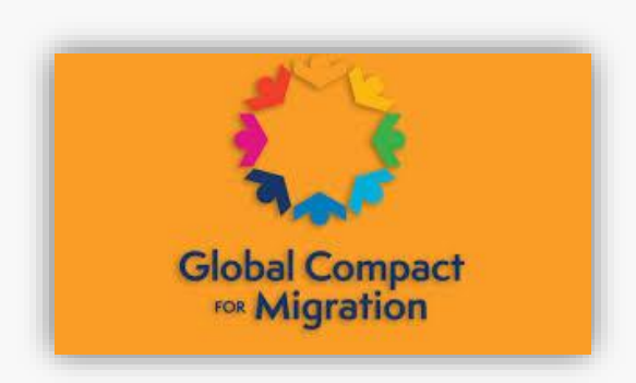
ROMENA Welcomes the Adoption of the Global Compact for Safe, Orderly and Regular Migration

UNODC Regional Office for the Middle East and North Africa welcomed the historic agreement of Member States to adopt the Global Compact for Safe, Orderly and Regular Migration during the Intergovernmental Conference which took place in Marrakech (Morocco) from 10 to 11 December 2018.