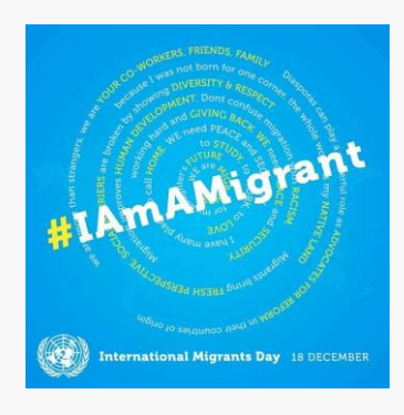
International Migrants Day – 18 December

The 2018 International Migrants Day came just days after the adoption of the landmark Global Compact for Safe, Orderly and Regular