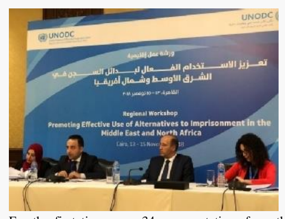
Using Alternatives to Imprisonment to Address Overcrowding in MENA Prisons

For the first time ever, 34 representatives from the Ministries of Justice, directors of prison administrations, judges, prosecutors and Attorney Generals, from six countries, i.e. Algeria, Egypt, Iraq, Jordan, Lebanon, and Morocco, came together in the UNODC-supported regional workshop on "Promoting Effective Use of Alternatives to Imprisonment in the Middle East and North Africa" under the UNODC Programme. Global Prison Challenges The participating delegations shared their national legislative context and current practices on the use of alternatives to imprisonment, challenges faced and specific needs to improve both theoretical and practical alternatives to imprisonment.