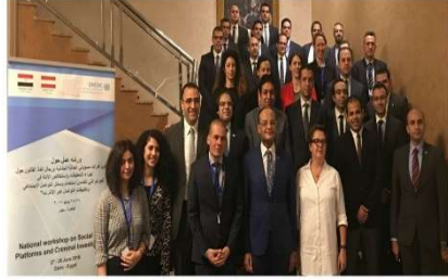
Egypt: Workshop on Obtaining Information from Social media and Internet Service Providers in Criminal Investigations