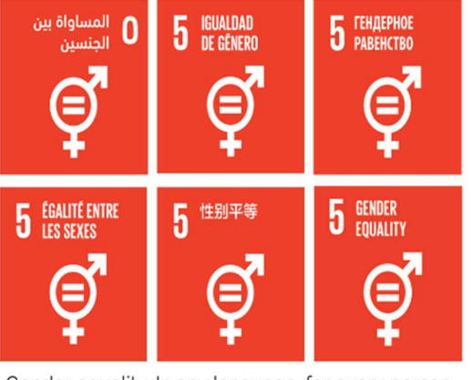
Gender equality. In any language, for every person.

Palestinian women to study forensic medicine despite the challenges they may face.