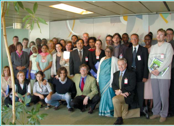
This publication is the result of a Theme Meeting of Experts and Youth on School-Based Drug Abuse Prevention held in Vienna from 2 to 5 September 2002 organised by the Global Youth Network.