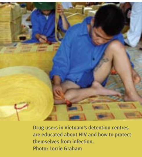
Drug users in Vietnam's detention centres are educated about HIV and how to protect themselves from infection.