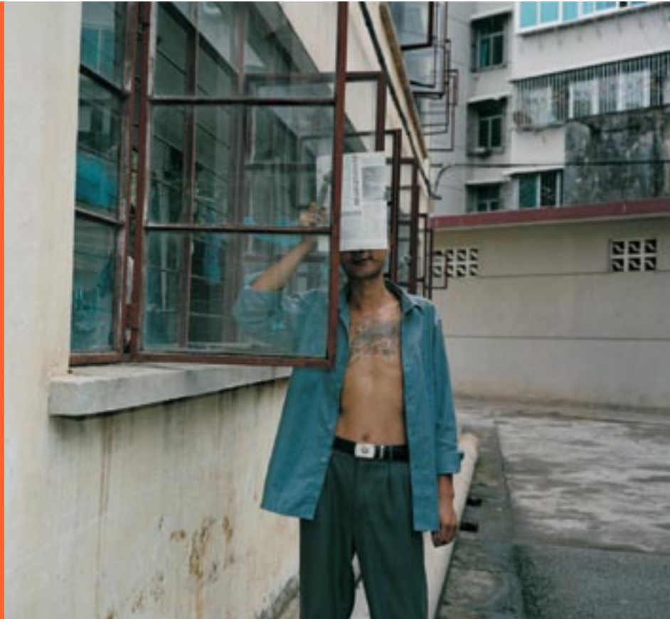
Injecting drug users are at higher risk of HIV transmission in China. Due to the stigma attached to drug usage, it is difficult for volunteers to access populations at higher risk and provide support and education.

Laws and policies that protect women and girls against sexual violence, disinheritance and gender discrimination (including harmful traditional practices and sexual violence) can have a huge impact on their ability to negotiate safe sex and address underlying causes of HIV transmission.