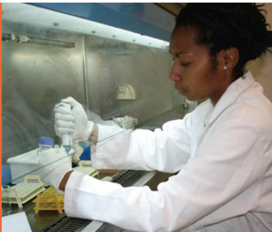
Support to PNG's Institute of Medical Research in Goroka is helping to build in-country social and medical research capacity in key health priorities.

Universal access to antiretroviral treatment is an important component of prevention strategies, helping people live significantly longer, healthier lives and providing them with a compelling reason to be tested so they know their HIV status. UNAIDS estimates that providing 80 per cent of people in need 43 with antiretroviral treatment will equal around 13.7 million people worldwide by 2010, and 21.9 million in 2015. Yet despite the obvious benefits, in Asia only 26 per cent of people in need currently have access to antiretroviral therapy (up from 9 per cent in 2004). In PNG, 36 per cent of adults and 29 per cent of children who needed treatment were receiving it at the end of 2007, making a total of 35 per cent of the total in need. 44