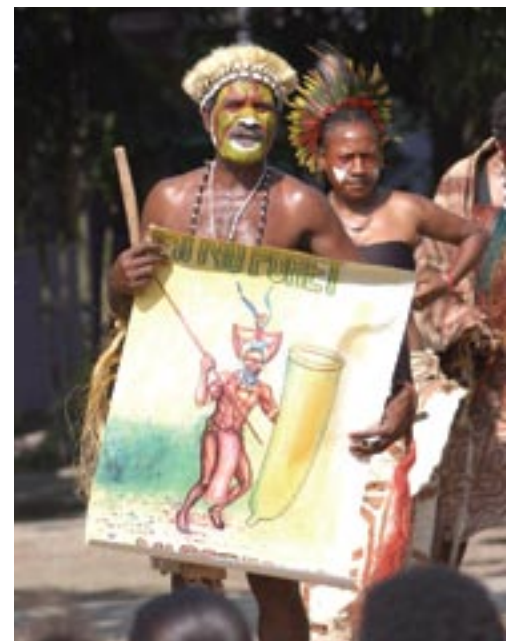
The Anglicare STOPAIDS theatre group is just one of many non-government organisations across Papua New Guinea staging plays at local markets, schools and other community meeting places to help inform and educate people about HIV.

While Australia's role in the African response will be relatively small in comparison, work will continue through the Global Fund and UNAIDS and through partnerships in strategic areas where Australia can influence and add value.