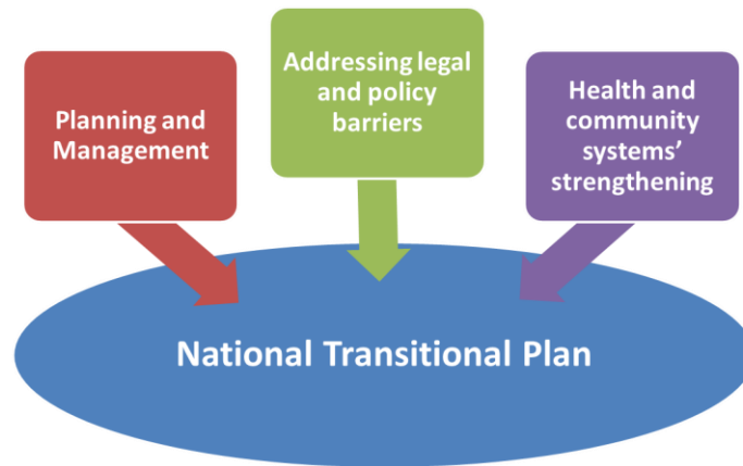
Figure 2: Pillars of a transitional framework

18. The Consultation generated consensus on the related recommendations. These are in line with ESCAP Member States commitments to intensify efforts to eliminate HIV and AIDS in the region, including deployment of national processes detailed in the Regional Framework for Action on HIV and AIDS beyond 2015, and the WHO/UNODC Principles of Drug Dependence Treatment. Additionally the following recommendations address concerns outlined in the UN Joint Statement (2012) on compulsory drug detention and rehabilitation centres. This is done by offering practical steps for addressing outlined concerns in accordance with the outcomes of the Commission on Narcotic Drugs (CND Resolution 54/5, 2011) which states the following: