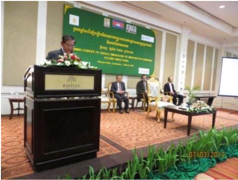
H.E Sar Kheng delivered the opening speech

H.E Sar Kheng had announced in this ceremony to officially launch: PIU Manual of Operations, Basic Training Material and Leaflet on migrant smuggling from now on.