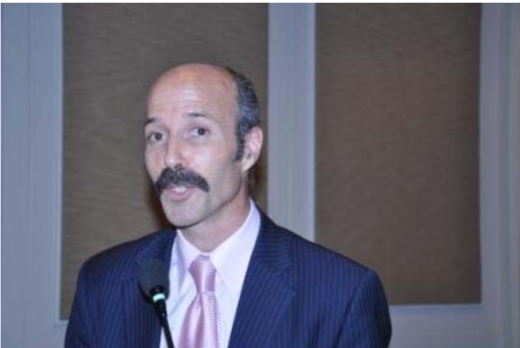
Representative of Canadian Embassy