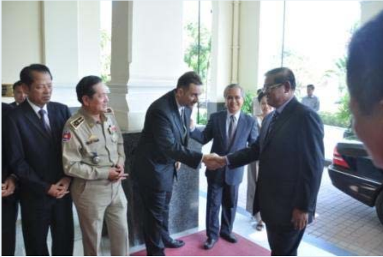
Interior information- Phnom Penh, 08 March 2013