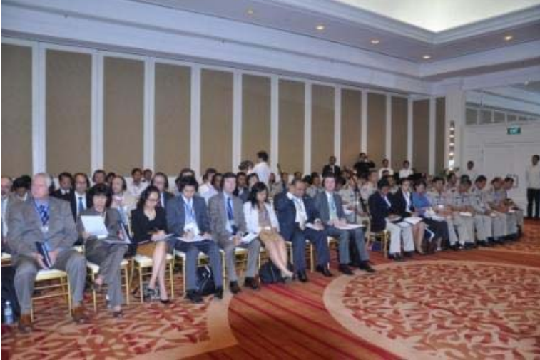
The overall views of participants during meeting.

His excellency, deputy prime minister and interior minister said in his opening speech that the migrant smuggling and human trafficking prevention has become more complicated requiring the specific strategic training with the modern equipments.