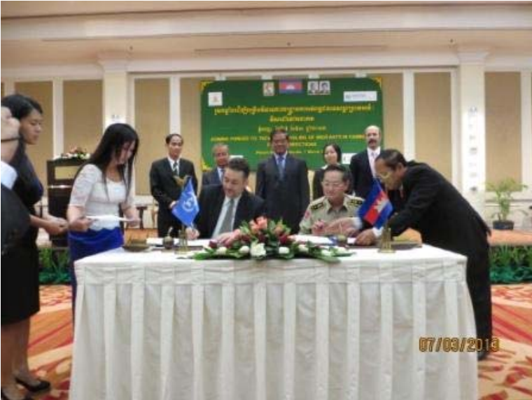
The signing ceremony on PIU Letter of agreement

In that opportunity, the signing ceremony on PIU Letter of agreement and PIU equipment delivery were conducted.