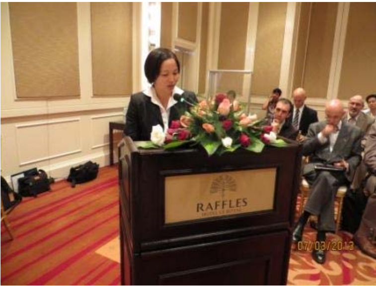
Representative of Australian Embassy