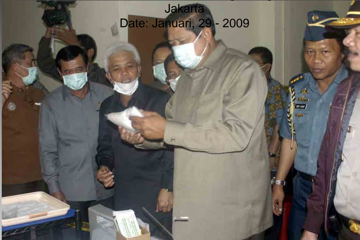
PRESIDENT REPUBLIC OF INDONESIA DR. H. SUSILO BAMBANG YUDHOYONO, CHECK ON THE CRIME SCENE