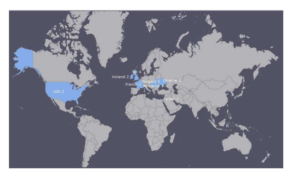
Figure 3: Countries in which the studies took place