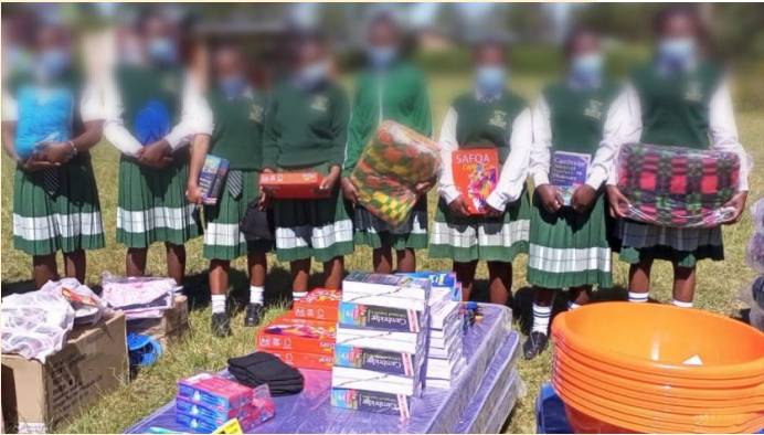
Girls at Liberty Girls Secondary school receiving their basic needs

Children who have exited rehabilitation schools and linked to Secondary Education: 23 children, 13 boys and 10 girls were successfully reintegrated back to the community through formal education. This was made possible through two private sector partners: Airtel and Fine Tech, Mirai Kenya, Individuals and two academic institutions (Liberty Girls’ and St. Patrick’s Boys’ Secondary Schools). These children have shown steady progress in their classwork and are among the well-behaved students as per their respective school principals. UNODC also provided to these children basic needs including educational material