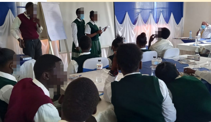
Children from St Patrick's Boys and Liberty Girls Secondary School during E4J training

students in the school were part of the training to promote inclusivity and integration. 13 teachers, 4 from Liberty and 9 from St Patrick's Secondary schools were also trained. The main outcome of the training was the two justice clubs formed in each partner secondary school. The justice club is composed of students and teachers.