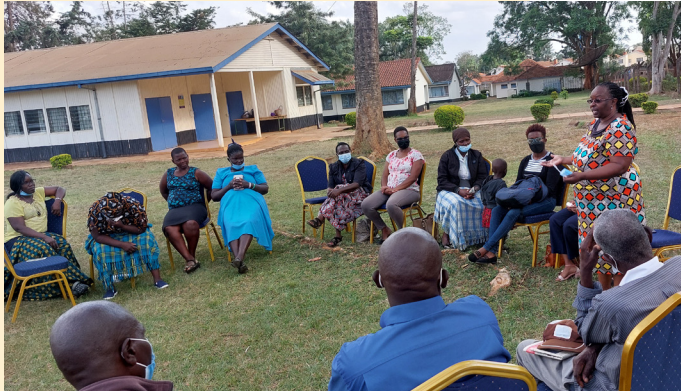
Parents during family group

21 candidates of those expected to sit for 2021 Kenya Certificate of Primary Education (KCPE) and who did not undergo the life skills training, individual assessments and family conferencing where necessary, will commence in January 2022. Out of this group four of them have already been exited but two will be returning to do their KCPE in March 2022. The purpose of this assessment will be to ascertain whether they want to continue to mainstream school or transition to Technical and Vocational Education and Training (TVET). It will also establish what support structures the child has in the community in which they will be returning to after sitting for their KCPE.