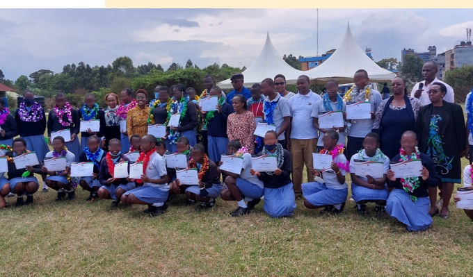
Children who were trained in life skills on their graduation day

Life Skills: 36 children (11 boys and 25 girls) from Kabete Boys and Kirigiti Girls Rehabilitation schools respectively, underwent the Life skills training from 25 October to 25 November 2021 which culminated in a colourful graduation on 26 November 2021. Behaviour change was evident through the psychosocial support provided as children were able to reach out to and reconcile with their parents. There was improved discipline in the respective institutions as children began the road to recovery from various levels and types of traumas. From the lessons learned, the girls made their own rules for cohesive and harmonious living while in the school.