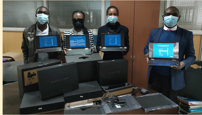
DCS Staff receiving the laptops

During the reporting period, the DCS undertook the following relevant partnership activities that contribute to the outcomes of this project: