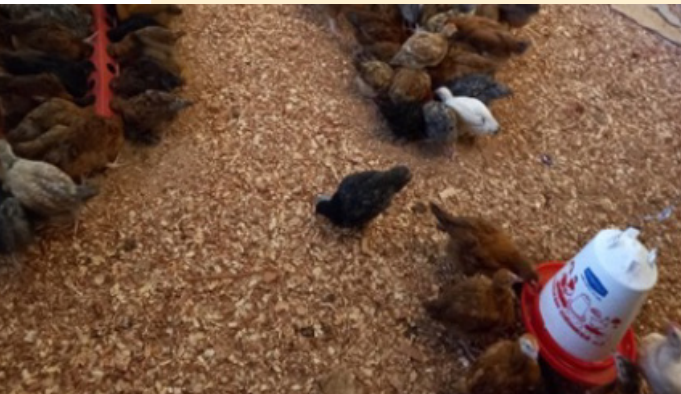
Poultry in Kabete Rehabilitation School

Variance, if any: There is no variation.