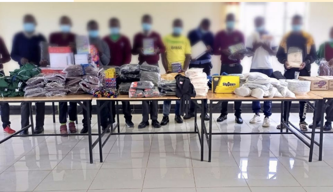
Boys at St. Patrick’s Boys Secondary school receiving their basic needs

such as reading books. The continuous follow-up of these children by UNODC and the Directorate of Children Services (DCS) Officers on the ground has helped the children not to revert to criminal activities.