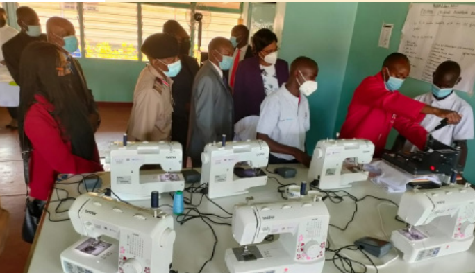
Tailoring and dressmaking equipment during the launch

Vocational Training Equipment: The equipment to strengthen the vocational training workshops for Electrical and Wiring, Tailoring and Dressmaking, Masonry, Carpentry, Poultry, Bakery and Confectionery, and Automotive; and equip children with skills in their areas of interest was procured and officially handed over to DCS on 10 November 2021. The skills learned will enable the children earn a living and be economically empowered in a bid to smoothen the reintegration process. For the number and type of equipment provided, please see Annex I.