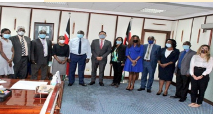
Courtesy call to the Cabinet Secretary