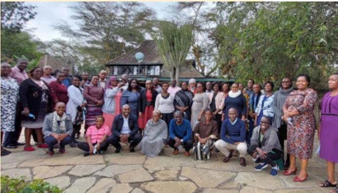
Stakeholders during the validation workshop of the Throughcare and Aftercare Procedures

Variance, if any: There is no variation.