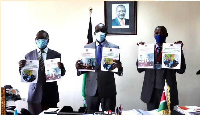
Senior Government Officials who presided over the launch

The Assessment Report on Rehabilitation and Social Reintegration Programmes Services and Practices for Children in Conflict with the Law in Kenya and the Blueprint for Rehabilitation and Social Reintegration Programmes for Children in Conflict with the law in Kenya were validated on 14 and 15 April 2021 respectively and published. The disaggregated participation of participants to the virtual workshop was 42 male, 47 female and 8 children. The two publications were officially launched on 28 April 2021 by the Chief Administrative Secretary for the Ministry of Labour and Social Protection in a virtual event with the aim of making the publications available for public use and for implementation of its recommendations by stakeholders within the criminal justice system. The event was attended by the stakeholders within the criminal justice system and development partners. There were 95 participants in attendance, 36 male, 47 female and 12 children.