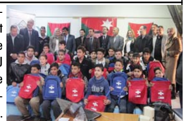
Children carrying their UNODC gifts

As part of UNODC ongoing awareness-raising campaign on child rights that started in October 2016, UNODC, the Juvenile Police Department and the EU Delegation in Jordan organized more than 75 visits to elementary and secondary schools in Amman and other cities. More than 2,000 students attended lectures and received awareness-raising material to inform them of their rights. The UNODC campaign aims to increase children’s awareness on their legal rights and procedures within the restorative justice system for children in contact with the law, and to ensure a child-friendly environment at the Juvenile Police stations around the country, in line with international standards. Project is funded by EU