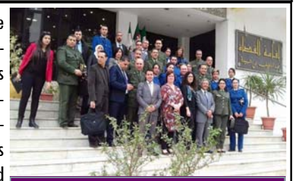
A group photo at the end of the training

In February, UNODC trained police officers, members of the Gendarmerie, judges and prosecutors working with children on the international standards, and on regional and national good practices in assisting and protecting child victims of crime. The training concluded with several recommendations including: Guides and tools be developed to raise awareness on the 2015 Law No. 15-12; Procedural manuals be developed for all justice and child protection actors to guide them when handling child victims cases; Juvenile police be trained on interviewing techniques of child victims and relevant international experiences be shared; and Capacity building on after-care, assistance and social and financial compensation for child victims of crime be provided. Activity is funded by Norway.