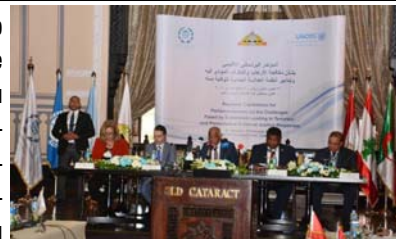
High level opening of the Conference

In February, UNODC in partnership with the Egyptian Parliament and the Inter-Parliamentary Union, held a major regional conference for Parliamentarians of Middle East and Northern African countries on the Challenges posed by extremism Leading to terrorism and preventative criminal justice responses. The Conference concluded with practical suggestions related to the development of effective national, regional and international legal frameworks against terrorism, extremism, radicalization and incitement; strengthening the central role of sustainable development in countering extremism leading to terrorism; fighting extremism in prisons; and strengthening cooperation with civil society organizations. Project is funded by Japan.