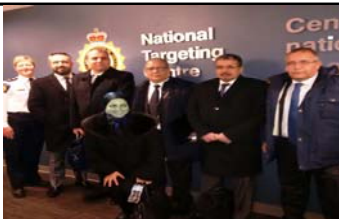
Delegate visit Targeting Centre

UNODC organized a study tour to Canada in March for a high-level Tunisian delegation to expose them to the Canadian experience in managing and analyzing border risks, including the analysis process, coordination and management, and information dissemination to field border