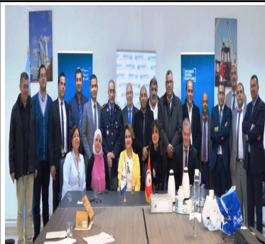
Training Culminated with a Group Photo

UNODC and the World Customs Organization (WCO) delivered a two-week practical training in February and March at the Port of Radès in Tunis. Officers from Customs, the Border Police, the Port Terminal and the Port Authority of the Port of Radès received capacity building in line with the latest international standards in profiling, selection and inspection of high-risk