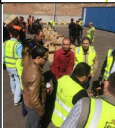
seizure of illicit goods

From January to March, UNODC and WCO undertook several mentoring and training sessions under the Container Control Programme, with a focus on strategic trade and export control for the Port Control Unit (PCU) at Aqaba Port and the Air Cargo Control Unit at Queen Alia International Airport. In February, Aqaba PCU received a study visit by PCU in Poti, Georgia. A high-level delegation from Georgia met senior Jordanian officials from relevant departments