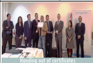
Handing out of certificates

In partnership with INTERPOL, UNODC delivered in January a basic and advanced training on “Management of information and criminal intelligence analysis at borders” for 30 Tunisian law enforcement officers from the Customs and 10 officers