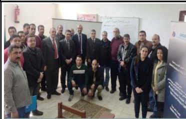
Hands-on HIV prevention training

Around 20 prison staff from the Borg ElArab, Fayoum and Wadi Al-Natroon prisons gathered at Tora Prison Training Centre in February to receive a UNODC training. Experts from the Ministry of Health and Population, the World Health Organizations and UN-AIDS, along with UNODC, delivered